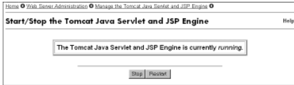
Figure 4–2: Start/Stop the Tomcat Java Servlet and JSP Engine Form