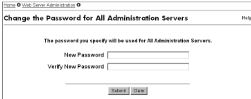
Figure 2–16: Change the Password for All Administration Servers Form