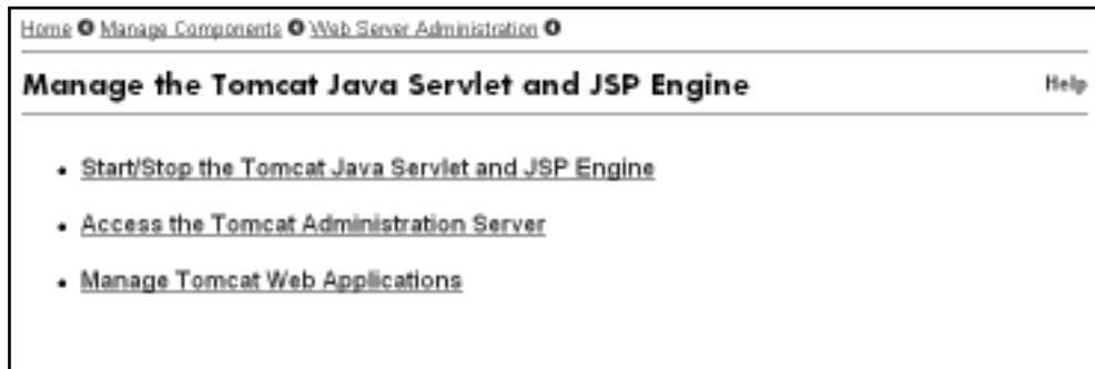
Figure 4–1: Manage the Tomcat Java Servlet and JSP Engine Form