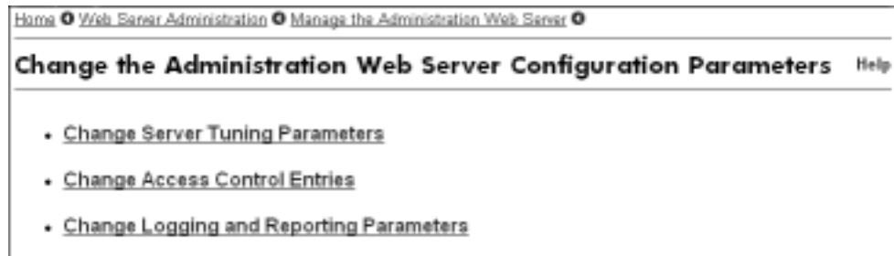
Figure 2–17: Change Administration Web Server Configuration Parameters Menu