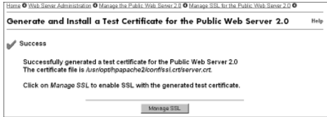
Figure 5–5: Test Certificate Installation Success Notice

With a test certificate in place, you can now try enabling SSL on the server.