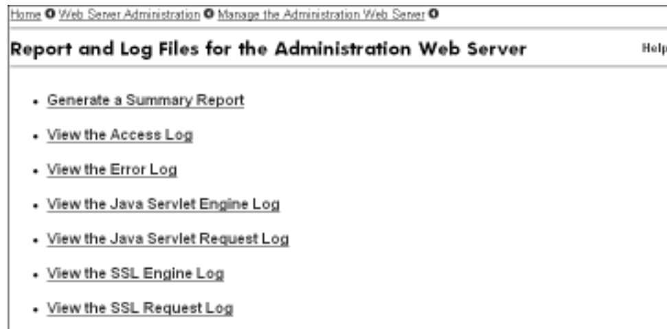
Figure 2–14: Reports and Log Files for the Administration Web Server Menu