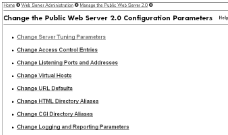
Figure 2–1: Change Configuration Parameters Menu for Public Web Server 2.0

The Secure Web Server configuration files are read in the following order: