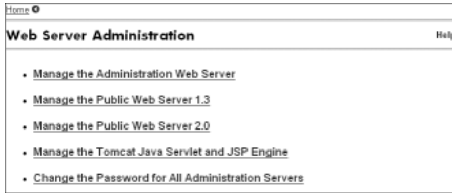
Figure 1–2: Secure Web Server Administration Menu

When you access the Web server, you are given access to privileged files and can perform system management tasks until exiting the browser. Do not leave an administration session unattended. Limit access to the admin account to those individuals authorized to perform Internet system management tasks.