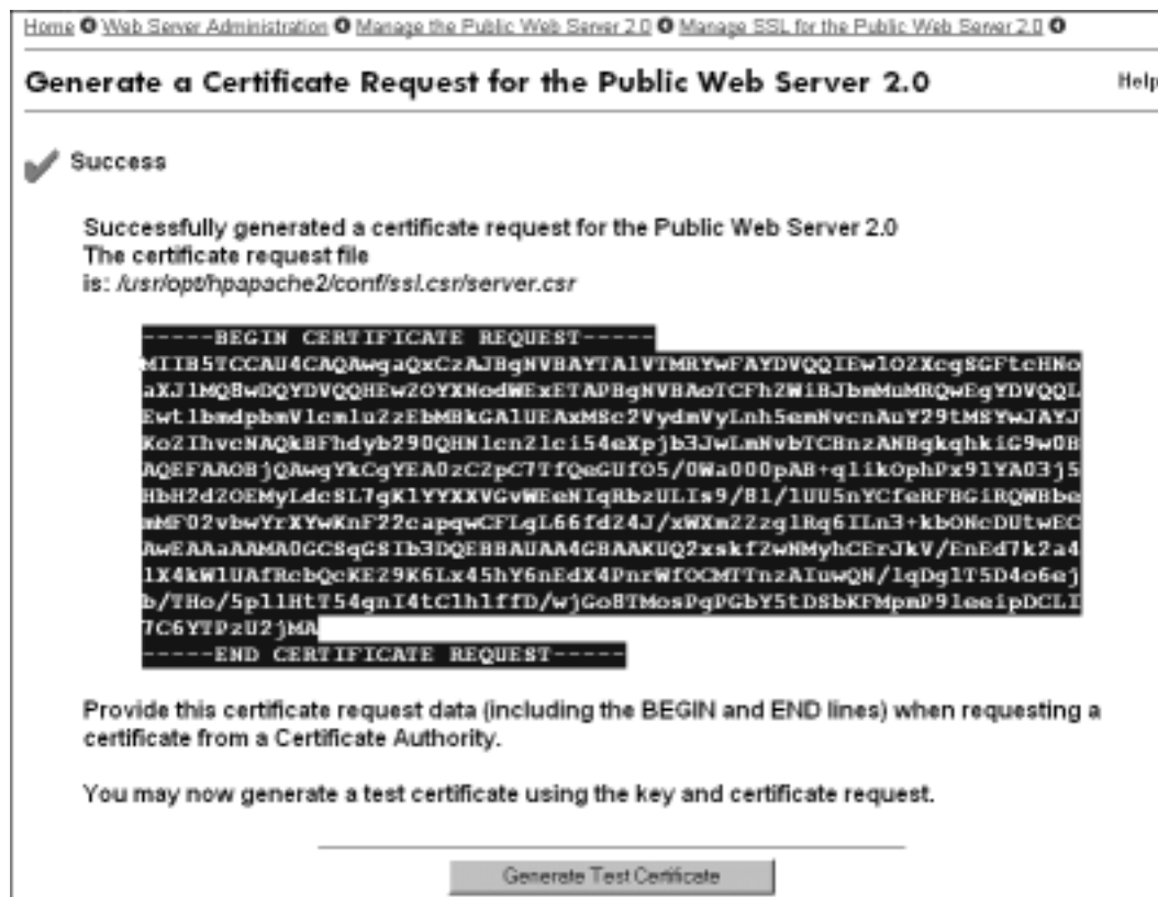
Figure 5–4: Certificate Request Success Notice