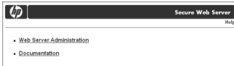
Figure 1–1: Secure Web Server Main Menu

When you choose Web Server Administration from the main menu, the Web Server Administration menu is displayed, listing the available servers and providing a link for changing server passwords. Figure 1–2 shows the Web Server Administration menu. In addition to the links for the Administration Web Server and Public Web Server, when you install Apache Version 2.0, an additional link, Manage the Public Web Server 2.0, is displayed.