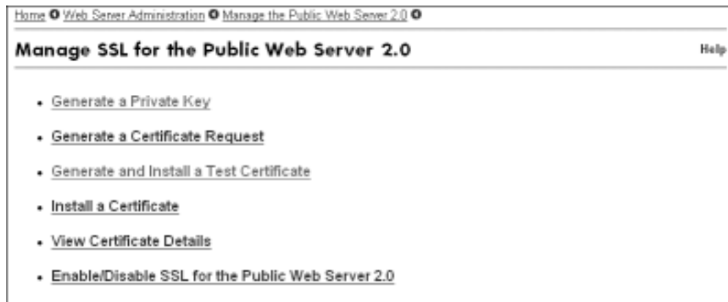
Figure 5–6: Manage SSL Main Menu with Additional Options

With a test certificate in place, you can now try connecting to the SSL-enabled system. Note that when you make an SSL connection to a server using a self-signed test certificate, you are warned that the certificate is signed by an untrusted source. The system gives you the option to accept the certificate and connect to the Web server.