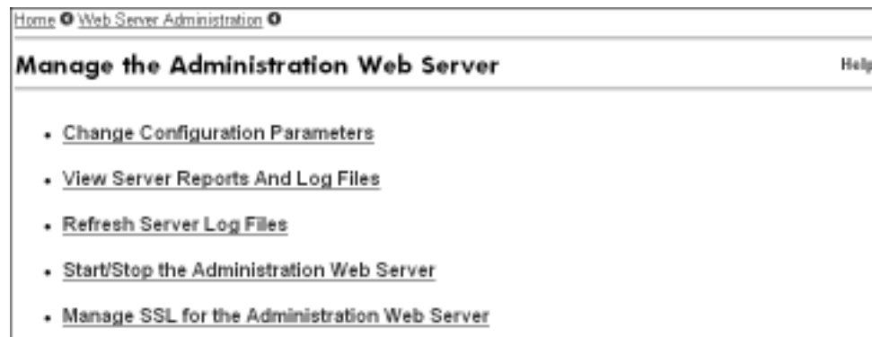
Figure 2–13: Manage the Administration Web Server Menu