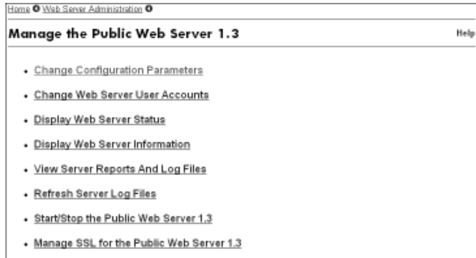
Figure 2–11: Manage the Public Web Server Form