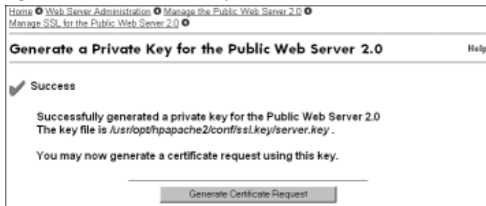
Figure 5–2: Generate a Private Key — Results

Figure 5–2 shows that a private key has been generated for the public Web server and the location of the server.key file. Note that you can generate a certificate request directly from this page, from which you can display the Generate a Certificate Request form. See Section 5.4 for complete steps for generating a certificate request.