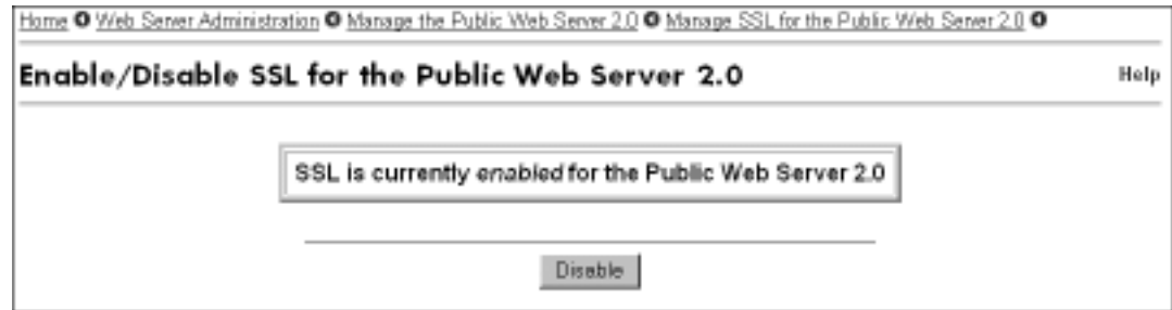
Figure 5–9: Enable SSL Confirmation Page