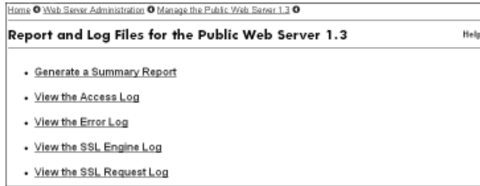
Figure 2–12: Reports and Log Files for the Public Web Server