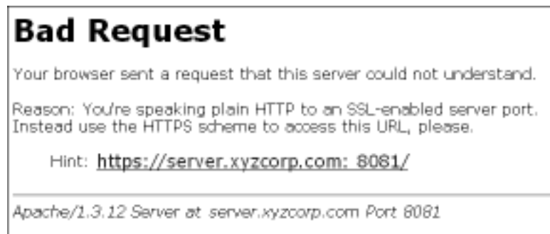
Figure 5–10: SSL Connections Error Message