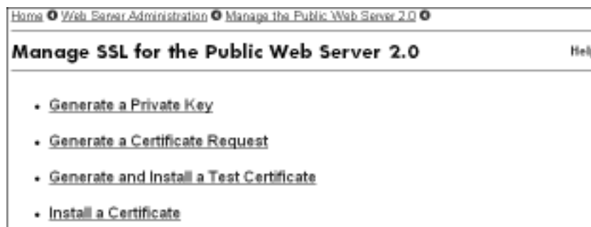
Figure 5–1: Manage SSL for the Public Web Server Menu

When you enable SSL for the first time, you must generate a private key and then generate a certificate request. A Certificate Authority (CA), such as VeriSign ( http://www.verisign.com ), processes the request and provides you with an official digital certificate. While waiting for your official digital certificate, you can generate and install a test certificate. These steps are described in Section 5.3 through Section 5.5.